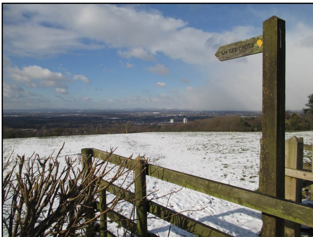
View from Werneth Low across to Manchester - December 2017

The Country Park was officially established in 1980 when the Hyde War Memorial Trust and Tameside MBC and the Greater Manchester Council entered into a formal agreement relating to the management of the park. Responsibilities relating to the Greater Manchester County Council were passed on to Tameside MBC in 1986 when the County Council was abolished.