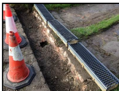
New drainage at the Lower Higham Visitor Centre Car Park

The cost of this work was paid for by Tameside Council - £2,850 .