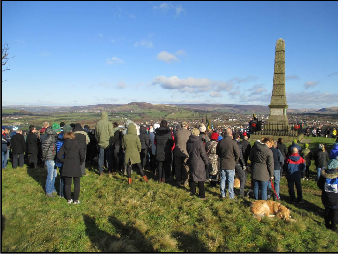
Remembrance Day, November 2017.