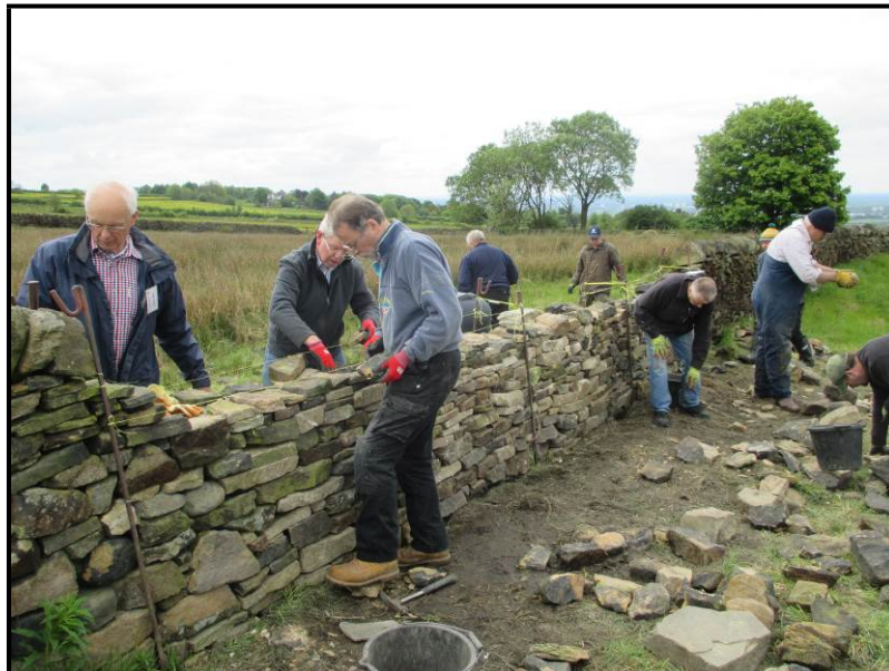
Dry Stone Walling Weekend at Hackingknife Meadow May 2017