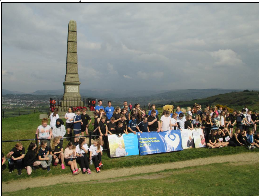
Alder Community High School run-around Werneth Low - 2 nd May 2017